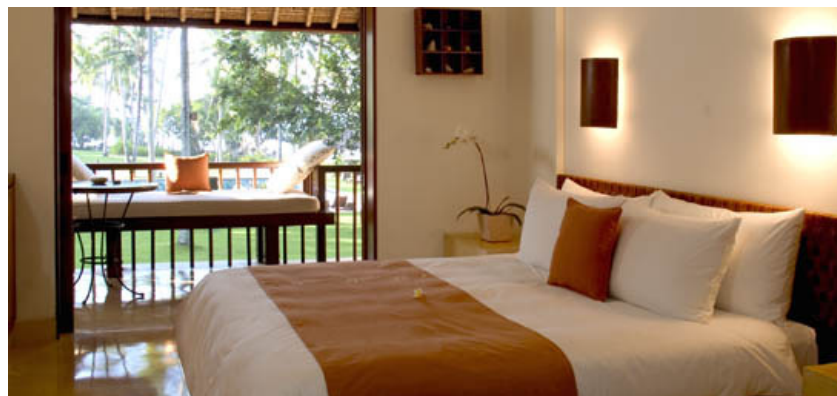
ALILA MANGGIS (2 nights) Balinese-inspired décor and architecture—complemented by stellar cuisine, a tranquil pool and a heavenly spa—invite total relaxation. www.alilahotels.com