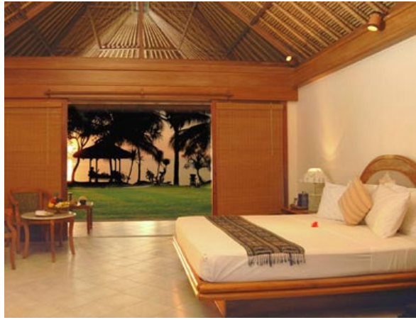
PURI BAGUS LOVINA (1 night) Overlooking the Bali Sea, this resort features villas with traditional architecture, private gardens and outdoor showers. Lovina Beach www.puribagus.net